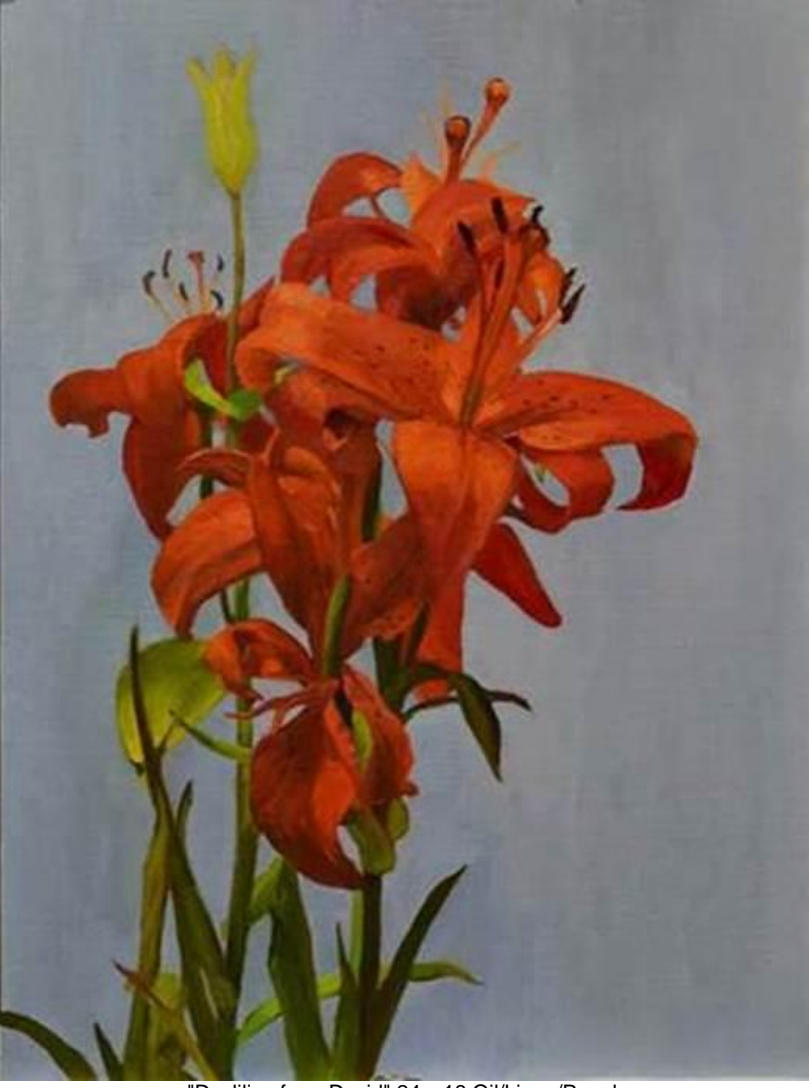
"Daylilies from David" 24 x 18 Oil/Linen/Panel