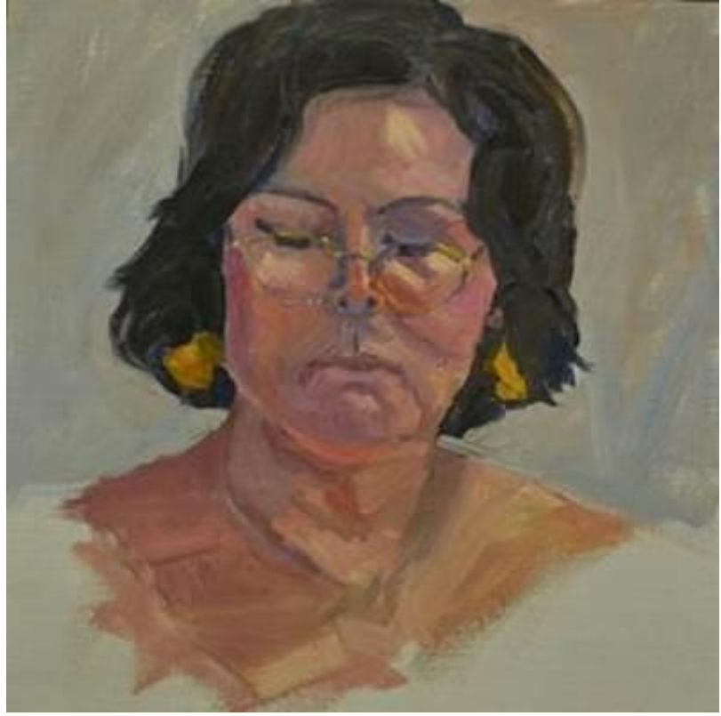
"Mary" 16x16 Oil/linen/panel