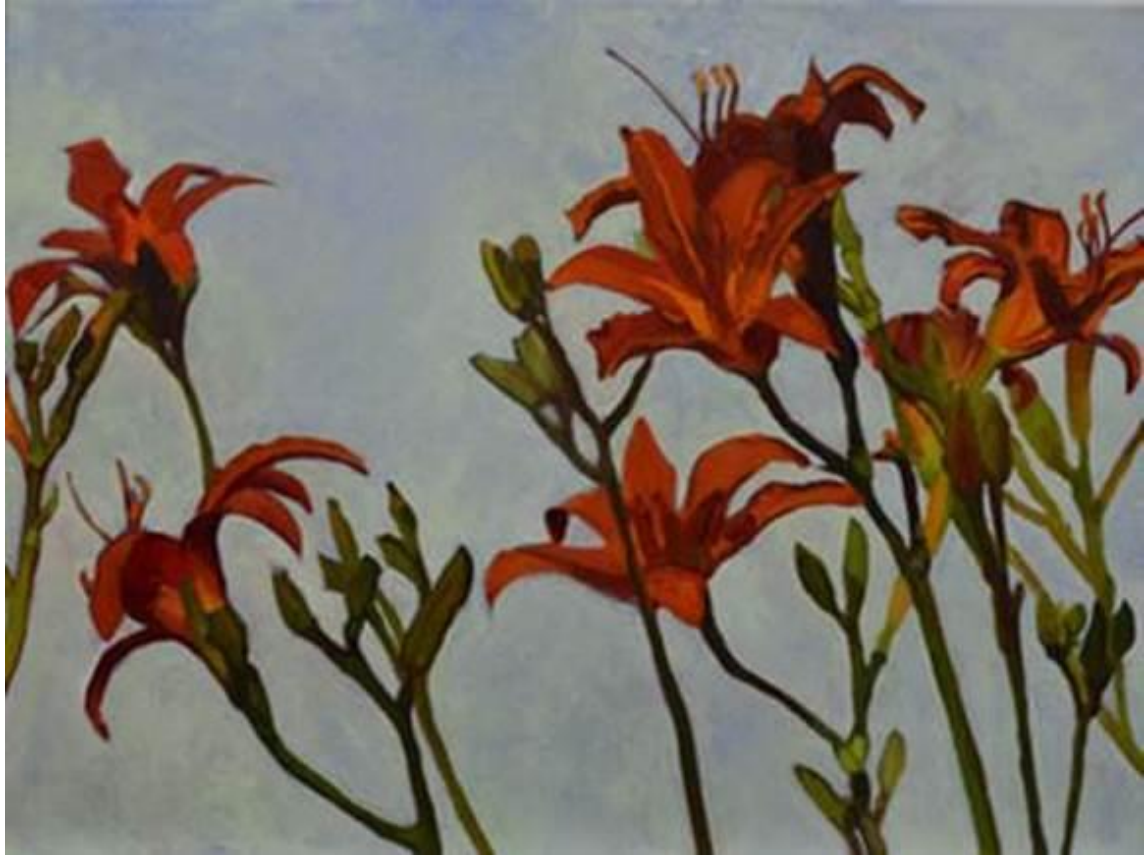
"Daylily Dance" 18 x 24 Oil/Canvas

To purchase these paintings, contact: Framed Image 5066 East Hampden Ave. Denver, CO 80222 303-692-0727 Hours: Tue-Fri 10-5:30, Sat 10-5 <u>info@framedimage.net</u> <u>www.framedimage.net</u>