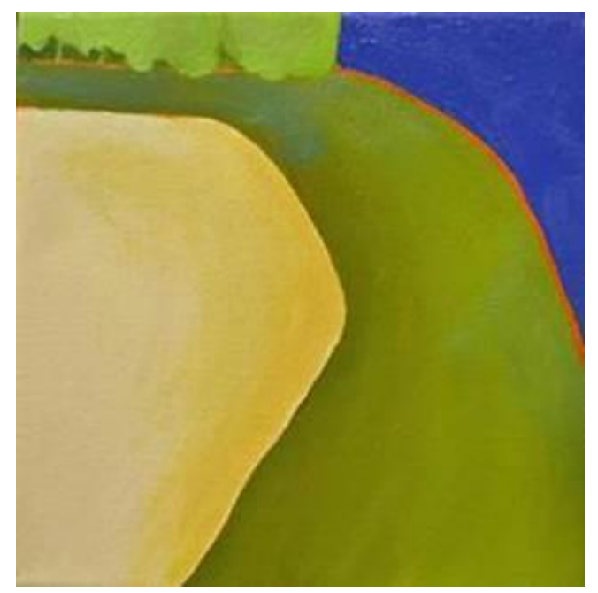
"Golf Series #8" 10x10 oil/canvas AKA "Between two hazards and a hard place"