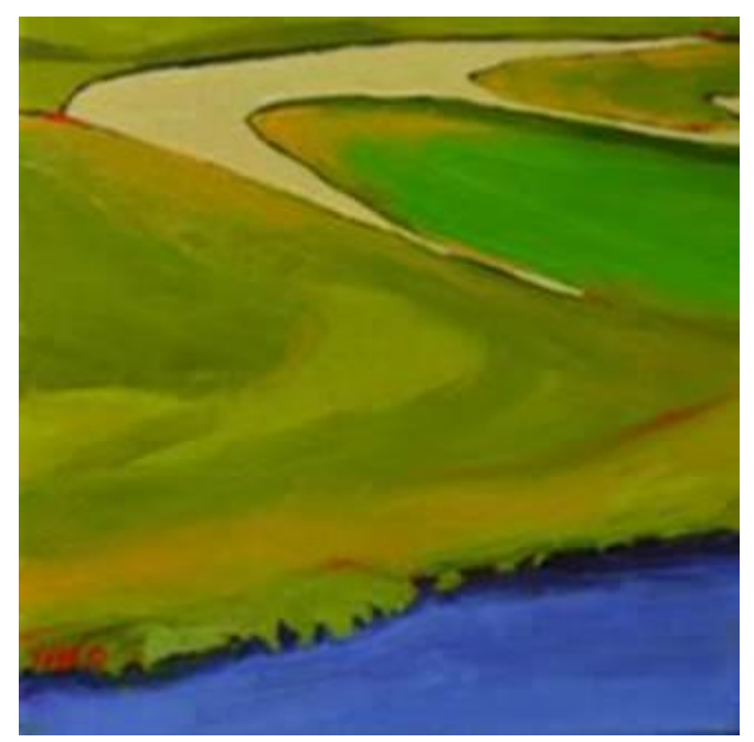
"Golf Series #7" 10x10 oil/canvas AKA "Trapped"