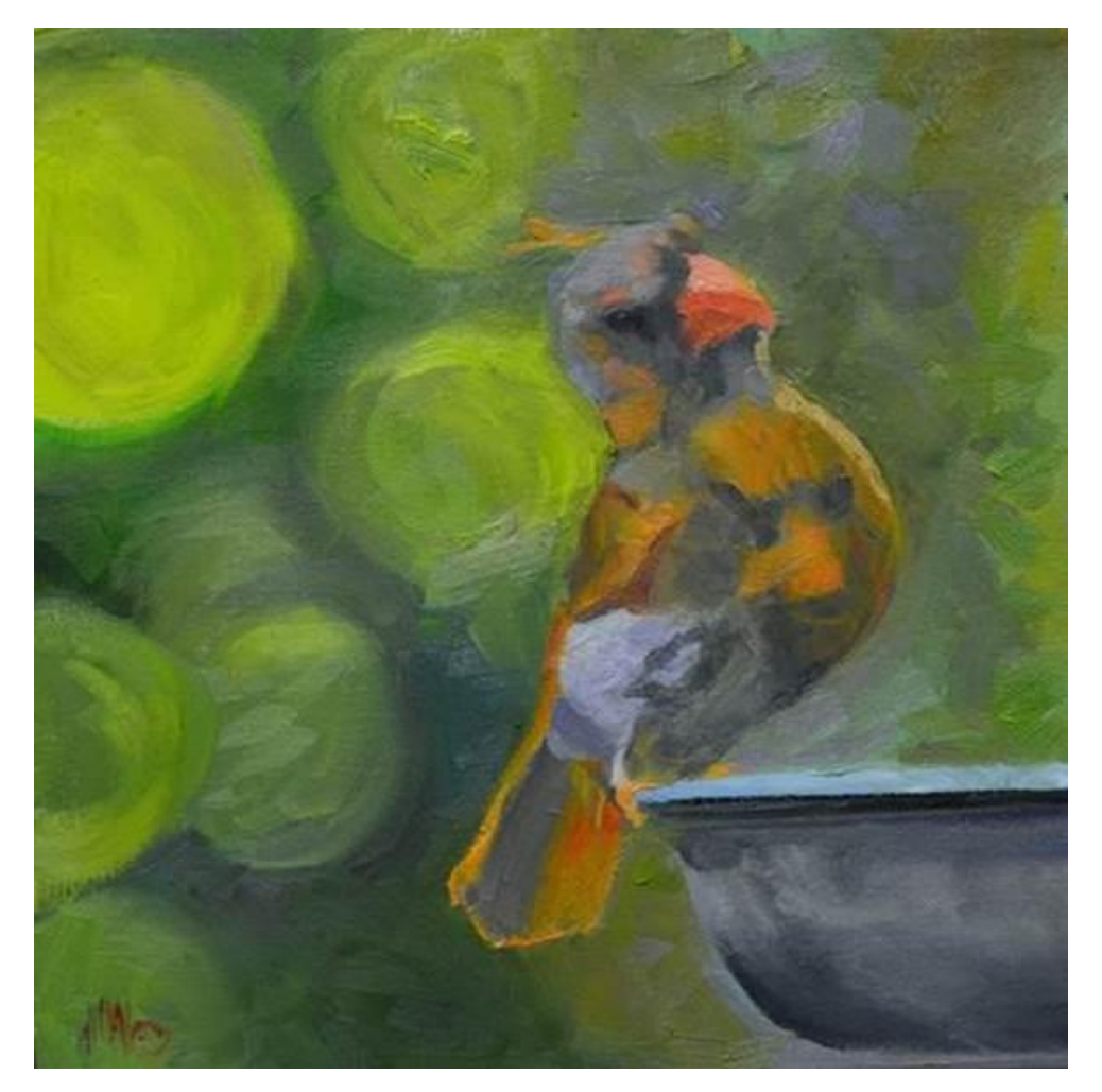
©What You Lookin' At? Juvenile Cardinal S.Carolina Private Collection