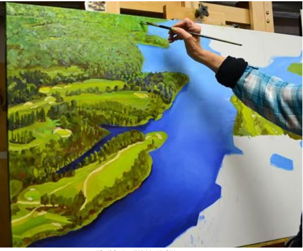
"Golf Series #6" 30x48 Oil/canvas "Let's get the yacht and watch the golf"?