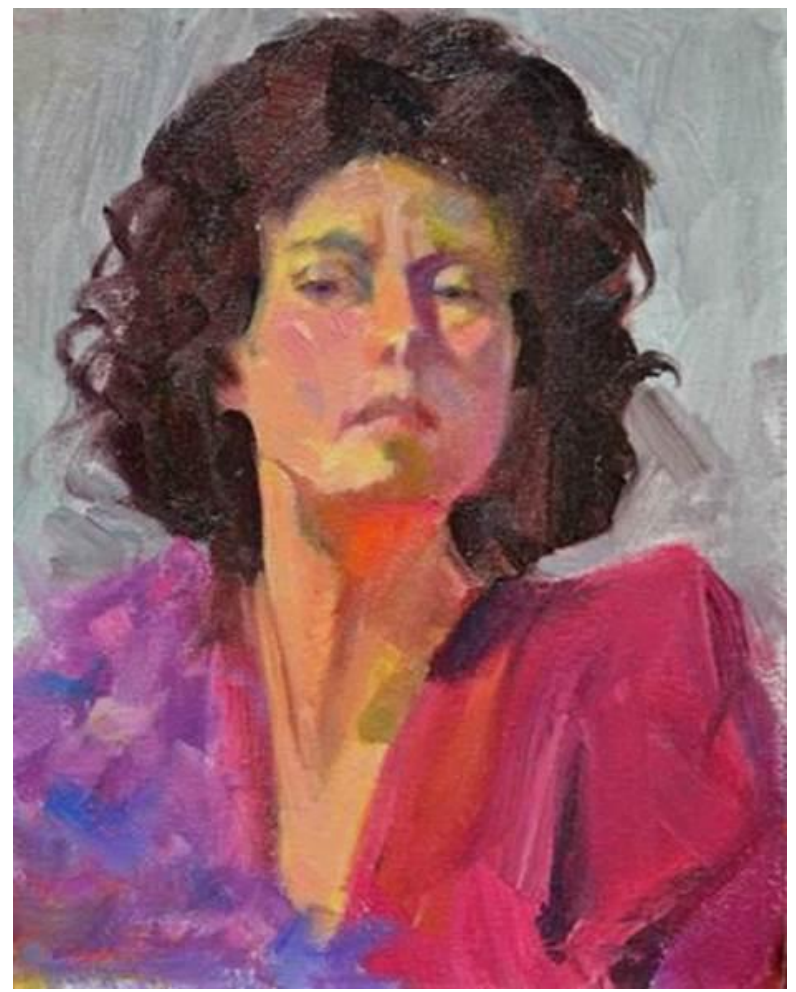
"Darby" 10x8 Oil/linen/panel