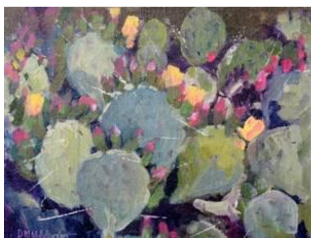
"Cactus Prickly Pear