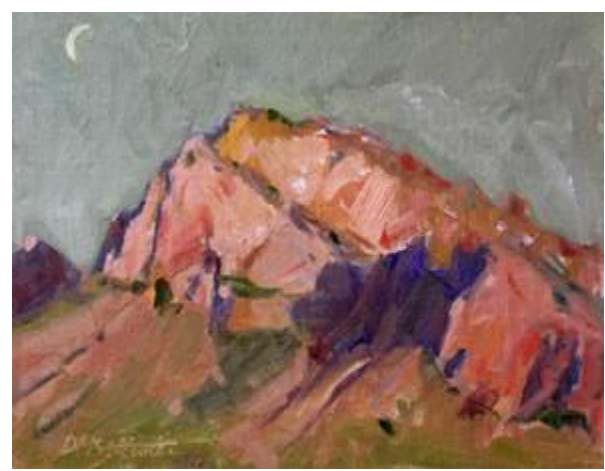
"Tucson Pusch Ridge"