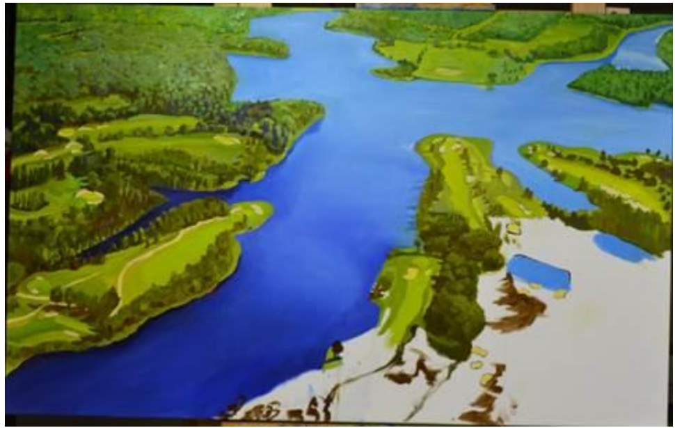
"Golf Series #6" 30x48 Oil/canvas

Maybe when it is done, I'll paint over it! #1 is still in the works and #9 and #10 are in the works too.