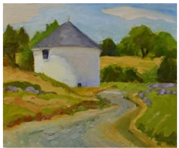
"Delaney Farm Round Barn" 10 x 12 Oil/Linen/Panel Click on image for more information

To purchase these paintings, contact: Framed Image 5066 East Hampden Ave. Denver, CO 80222 303-692-0727 Hours: Tue-Fri 10-5:30, Sat 10-5 info@framedimage.net