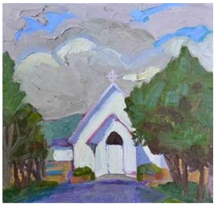
"St. Philip in the Field" 10 x 10 Oil/Linen/Panel Click on image for more information