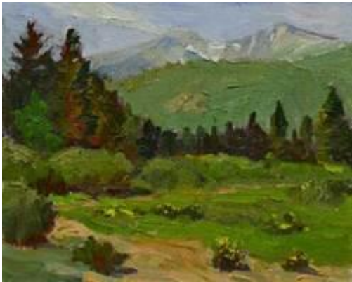
©Longs Peak at Lily Lake

And so did these three Plein Air Sketches of Rocky Mountain National Park!