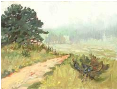
©Elk Meadow Fog

Stop by and take a look when you are downtown! Any of these would make a unique Holiday Gift! Click on images for details.