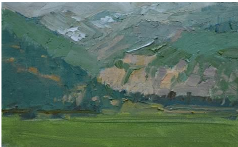
This little gem is just a beautiful little 5x8 done in Moraine Park, Rocky Mountain National Park on a cloudy day.

Every month we'll feature a small painting at a reduced price without the frame! When you click on buy now you'll see the reduction in the price. If you want it with the frame please contact me. Click on painting to take you to the buy now feature.