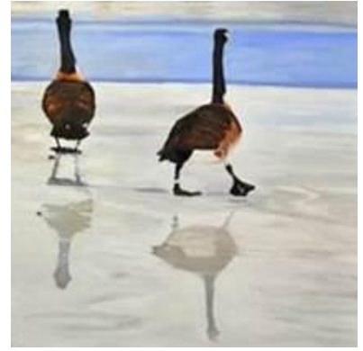
©Canadians Figure Skating 24 x 24 Oil/Canvas