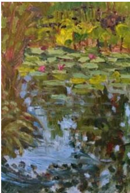
©Water Lily Pond