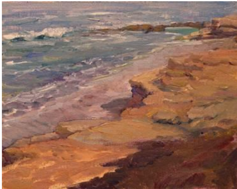
“La Jolla Cliffs, California” 8x10 Oil/linen $875

“Painted En Plein Air with the Salmagundi Group”