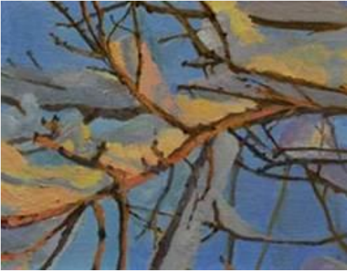
©Snowmelt 8 x 10 Oil/Linen/Panel

November/December 2016 Click on images to see details.