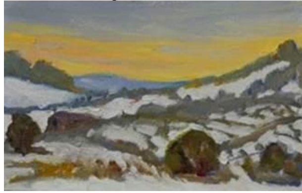
©Deer Creek Canyon Park 5 x 8 Oil/Linen/Panel Plein Air