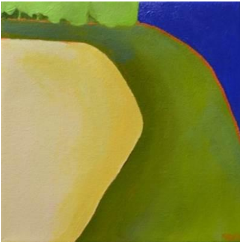
©"Between Two Hazards & a Hard Place" Golf Series #8

Exhibition Dates: Nov 18 – Dec 28, 2016 Third Friday Artist Reception: Nov 18 | 5:30–8pm 200 Grant Street Denver, CO 80203 303-778-6990