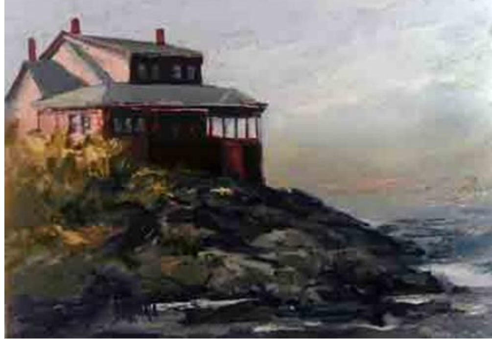
Night Light oil on canvas 8 x 8