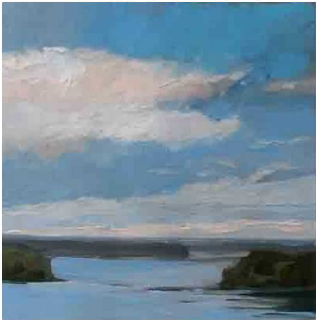
"Up River'' 8x8 oil on canvas

Looks like you'll have your hands full! Can't wait to read your book and see your larger canvases. It would be wonderful to have the World Tour revived. Much success to you in all your endeavors.