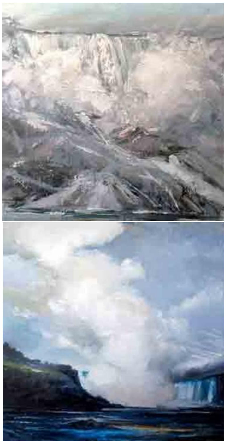
"Niagara Whispers" 8x8 oil on linen