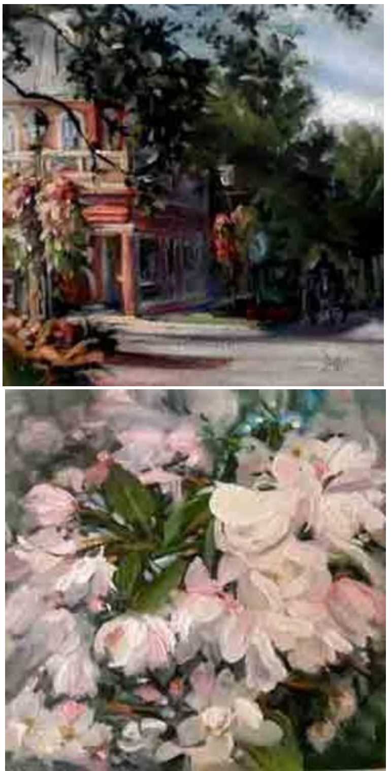
Prince of Wales 12 x 12 Oil on panel