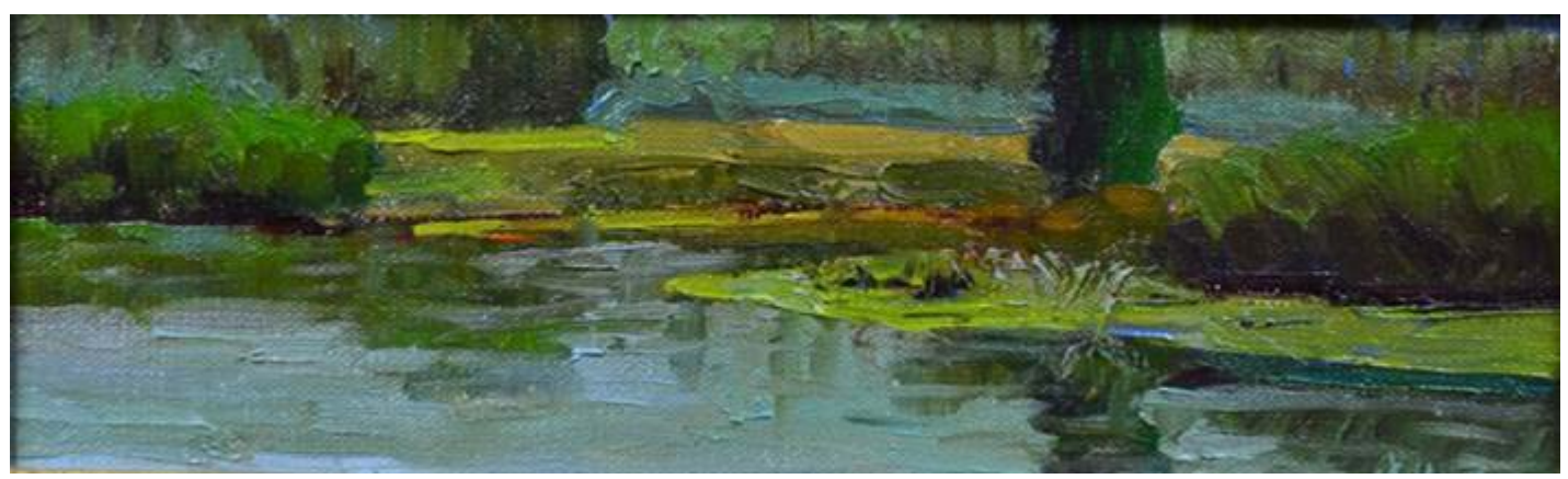
To purchase these paintings contact:

Framed Image 5066 East Hampden Ave. Denver, CO 80222 <u>map</u>