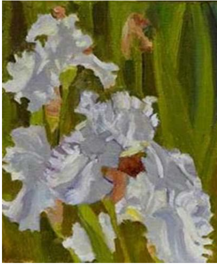
"Alabaster Unicorn" 12 x 10 Oil/Linen/Panel Plein Air $750