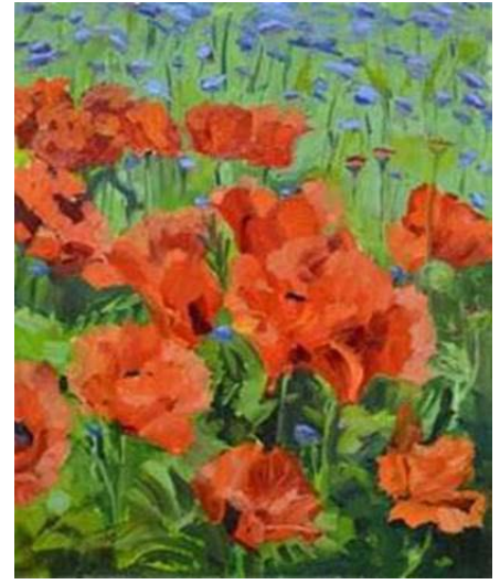
"Poppies & Cornflowers" 12 x 10 Oil/Linen/Panel Plein Air $750