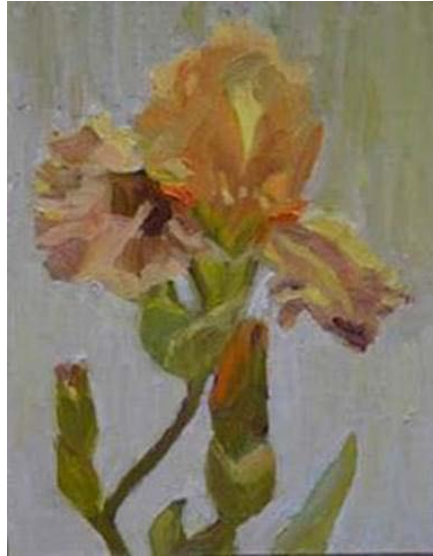
"Aardvark Lark" 10 x 8 Oil/Linen/Panel Plein Air $600