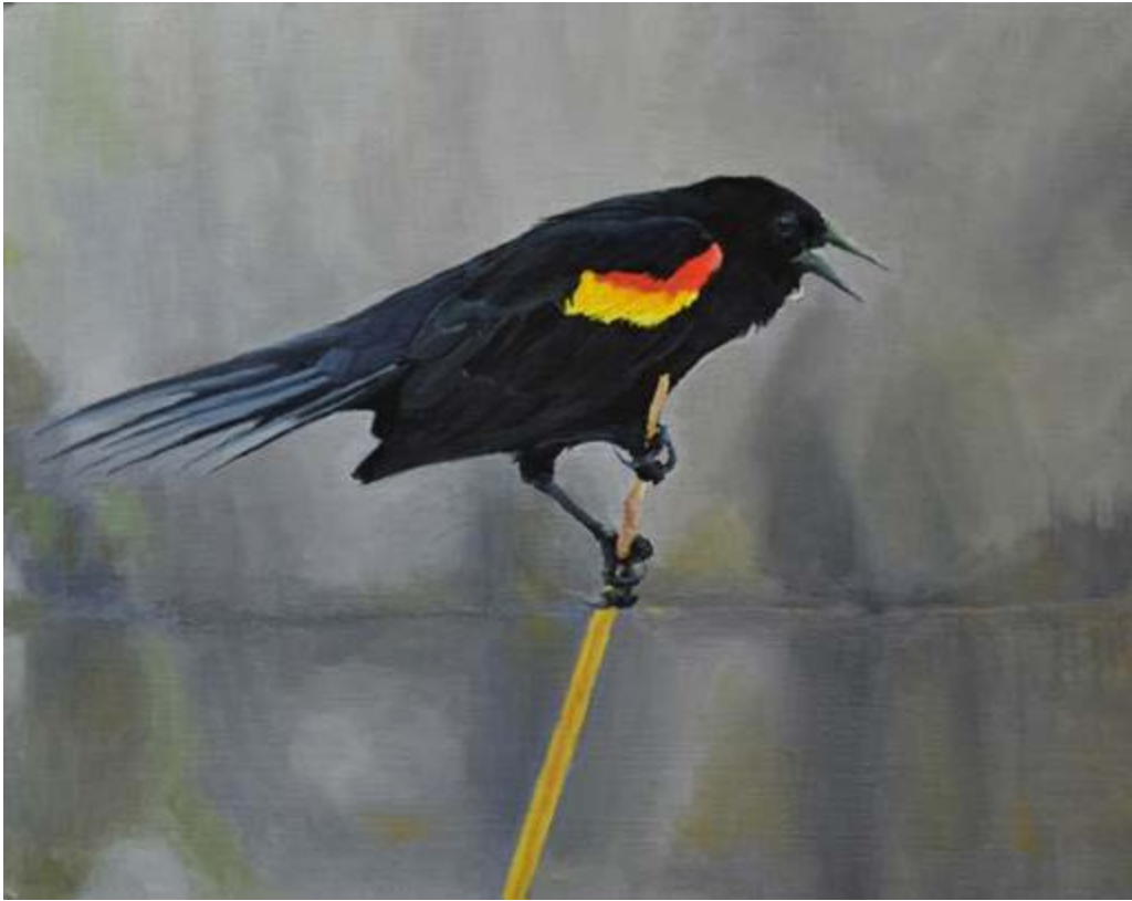
"Don't Sass Me" Red-Winged Blackbird AKA "Stay Away From My Nest!"