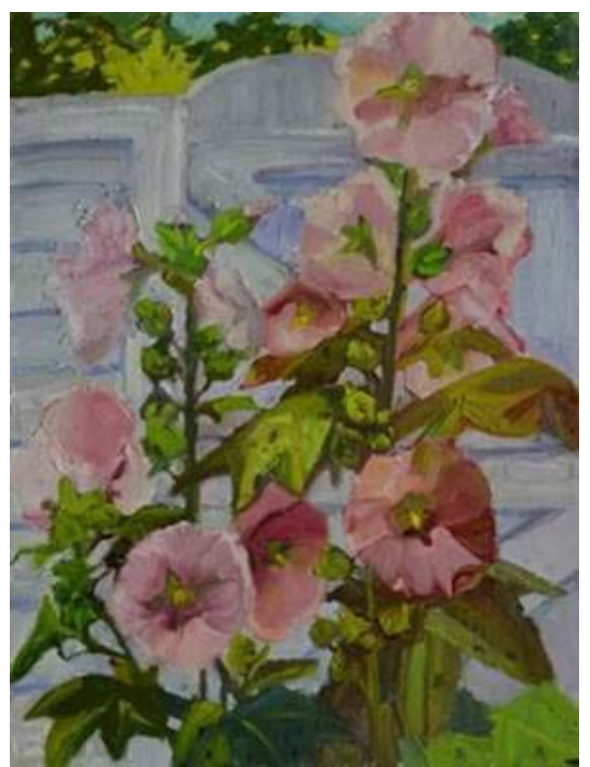
©Hollyhocks by the Garden Gate 16 x 12 Oil/Linen/Panel Plein Air $875 (Framed)