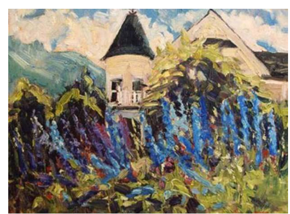
©Garden at Agate Hill Inn 12x16 Oil/Linen/Panel Plein Air $875 (framed)