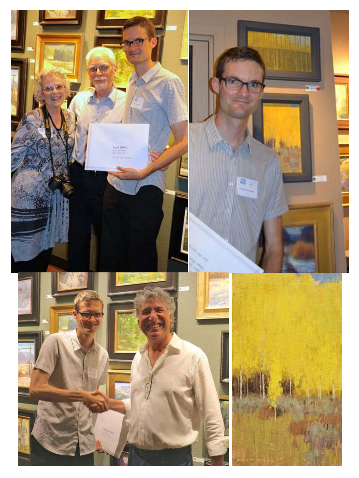
If you have not seen the PAAC Show at Mary Williams Gallery in Boulder, it is worth the trip. This is a very strong show, the best Plein Air work we have seen all in one place,

and it is beautifully hung. Just a feast for the eyes and all paintings are for sale at very reasonable prices! But only until AUGUST 30<sup>th</sup>! If you want to you can view the show online and call the gallery to purchase.